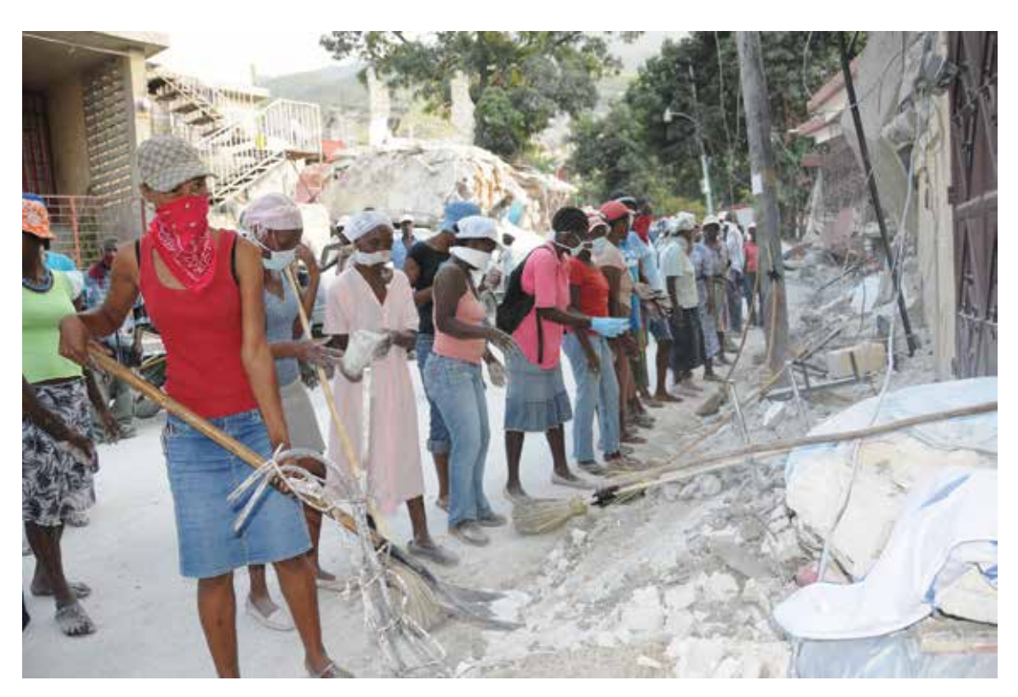
Women clear rubble as part of United Nations Development Programme cash for work programme, Haiti.