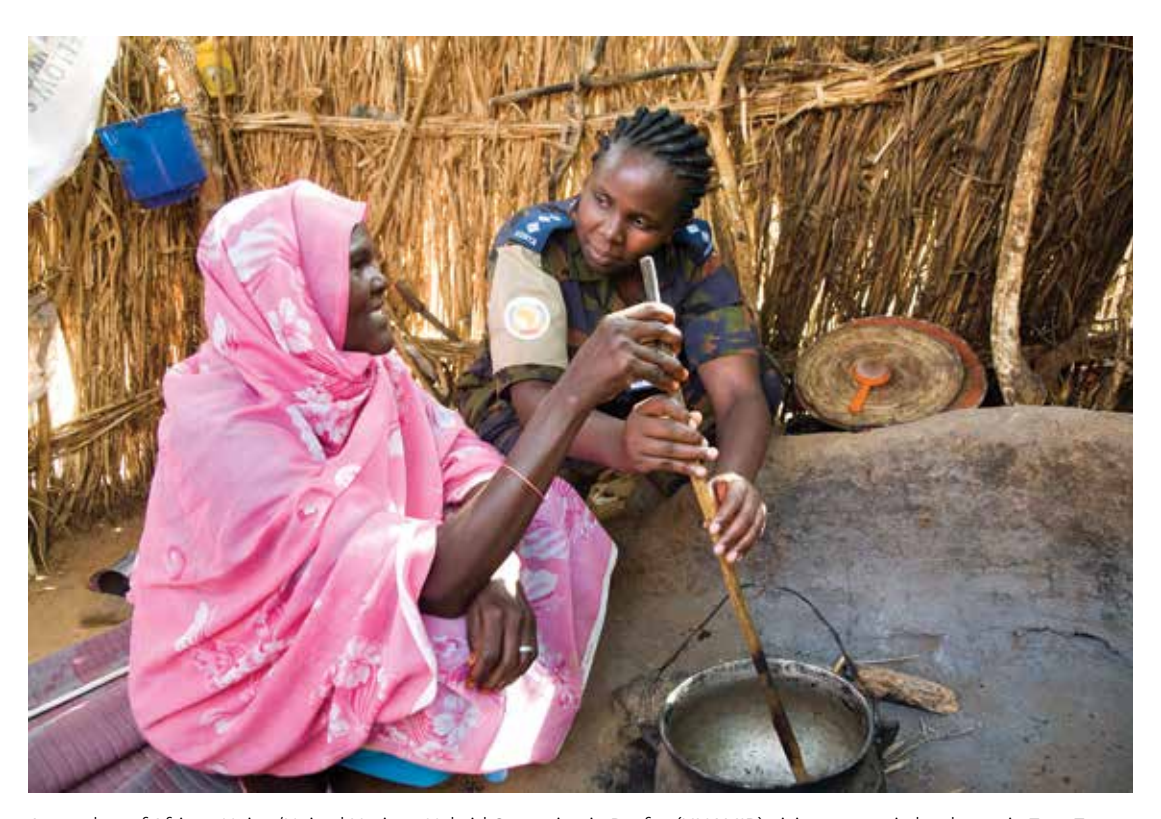
A member of African Union/United Nations Hybrid Operation in Darfur (UNAMID) visits woman in her home in Zam Zam Internally Displaced Persons (IDP) Camp, Northern Darfur, 2010.