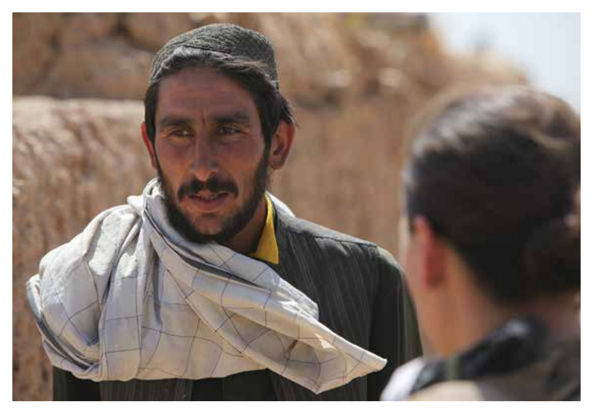
A member of Female Engagement Team, I Marine Expeditionary Force (Forward), speaks with a local Afghani man while on patrol, Boldak, Afghanistan, 2010.

Wider benefits of the presence of female peacekeepers, in particular, have also been reported. Following the arrival of the female Indian Formed Police Unit in Liberia in 2007, the number of local female applicants to the Liberian National Police immediately rose from 120 to 350 (UNDPKO/DFS 2008: 34). The UN Department of Peacekeeping Operations has credited the presence of female peacekeepers with encouraging women to enter the security sector, thus 'challenging traditional ideas of gender roles' (UNDPKO 2010: 10). Despite these examples, some researchers advise caution, arguing that 'it is unwise...to draw firm conclusions on the impact of women peacekeepers', given that at this point the evidence is largely anecdotal and ad hoc (Jennings 2011: 5,6).