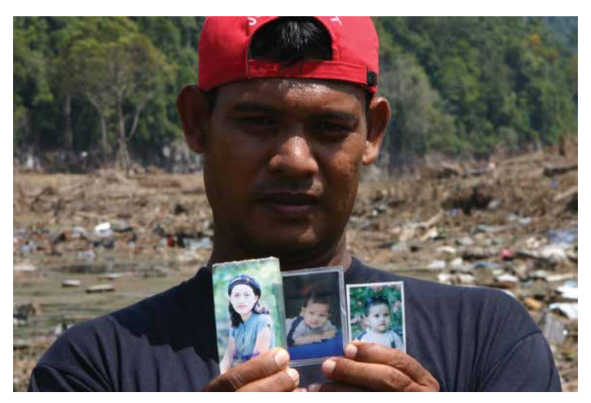
Survivor of the Indian Ocean Tsunami, Aceh, Indonesia.

were women (Deen 2010). Sixty-one per cent of fatalities from the 2008 Cyclone Nargis in Myanmar were women (AusAID 2011b: 1). Similar statistics can be found for some of the areas hit hardest by the 2004 Indian Ocean Tsunami: in four villages in North Aceh district in Indonesia surveyed by Oxfam International, females accounted for 77 per cent of fatalities (Oxfam International 2005: 2). In another village—'the worst affected village' according to Oxfam International—women accounted for 80 per cent of the deaths (2005: 2). Some affected areas of India and Sri Lanka showed similarly high numbers of female deaths (Oxfam International 2005: 2; Pincha 2008: 24).