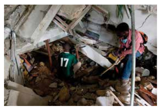
Men clear rubble to try and reach survivors of earthquake, Haiti, 2010

the Indian Ocean tsunami, including Sri Lanka (Oxfam International 2005). Their more limited 'self-rescue' abilities (Neumayer and Plümper 2007) were challenged by traditional clothing, which severely limited their mobility (Chew and Ramdas 2005: 2; Neumayer and Plümper 2007: 554). As was documented in Tamil Nadu, India, for some women who lost their saris in the waves but managed to stay alive, 'strong internalized values of nudity and shame' prevented them from moving to safer ground (Pincha 2008: 24). In addition, the primary domestic responsibilities and roles of women and girls in many countries