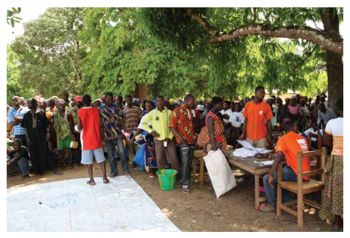
Displaced Ivorians queue for food at a distribution site run by the UN Refugee Agency and Norwegian Refugee Council, Liberia, 2011.

20).<sup>30</sup> There is widespread recognition of the link between men's loss of traditional roles and an increase in domestic violence. UNFPA's State of World Population 2010 has observed that '[t]he shift in traditional gender roles is now widely considered to be a factor in the rise of domestic violence within