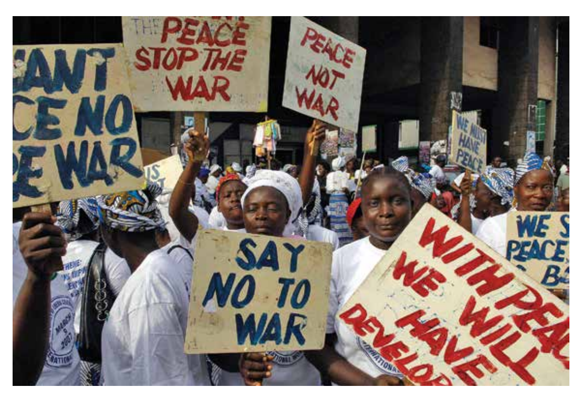
Women demonstrate against violence as part of their observance of International Women's Day, Monrovia, Liberia, 2007.

2002: 132, 133). For girls who were subjected to forced marriages with combatants, remaining with their 'captor-"husband" may seem like the 'best, and perhaps only, option' (McKay and Mazurana 2004: 56).