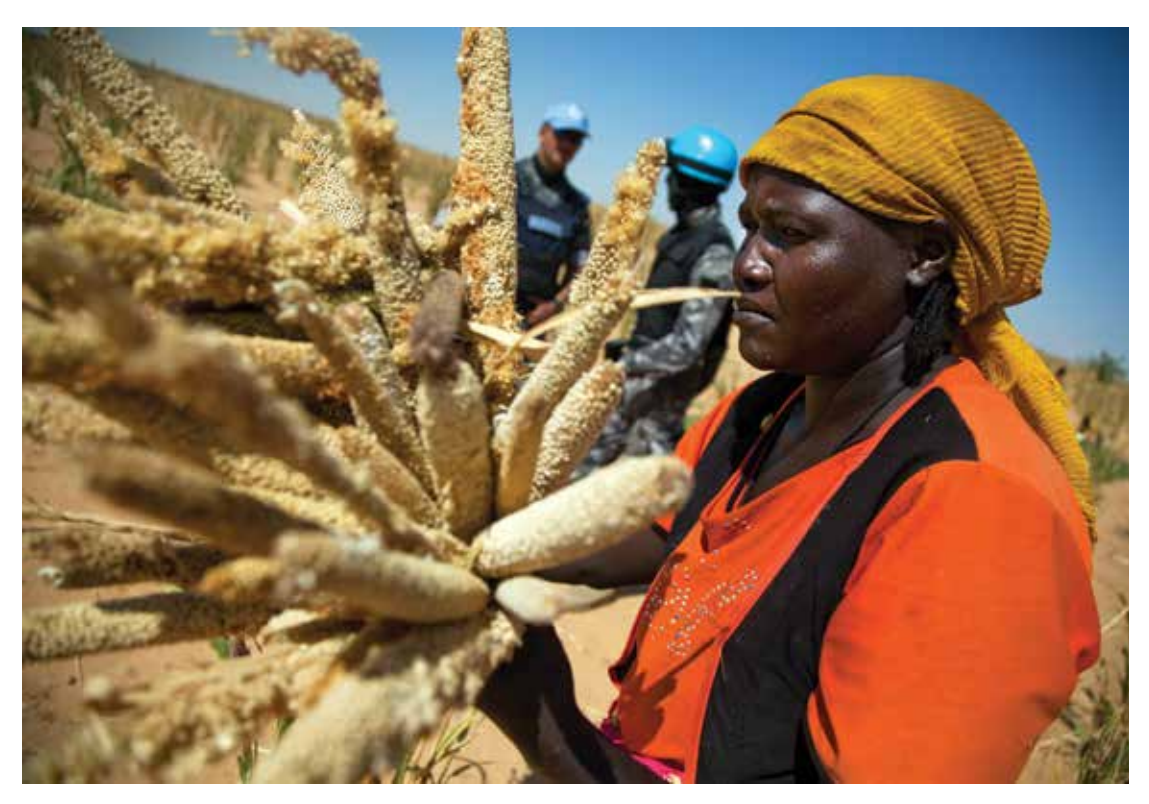
A woman collects millet, escorted by Jordanian peacekeepers as part of a patrol by the African Union/United Nations Hybrid Operation in Darfur (UNAMID), North Darfur, 2010.

An essential component of adopting a gender perspective in any program is ensuring the equal participation of and consultation with women, men, girls and boys in design, implementation and